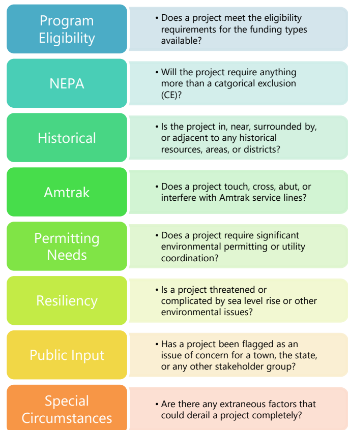
Figure 2 -- Evaluating Project Readiness and Anticipating Project Conflicts

Because the IIJA delivered several new funding types which must be utilized by the end of this federal fiscal year, RIDOT also deployed an eight-step process to evaluate readiness and anticipate project conflicts. This process, shown in Figure 2, considers each project's program eligibility, anticipated NEPA requirements, expected historical resources, Amtrak coordination estimates, permitting needs, environmental resiliency impacts, public input history, and other special circumstances.